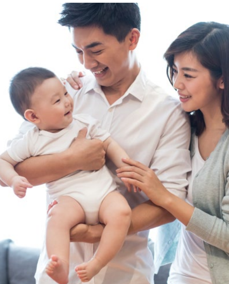
Chart a secure future for your child